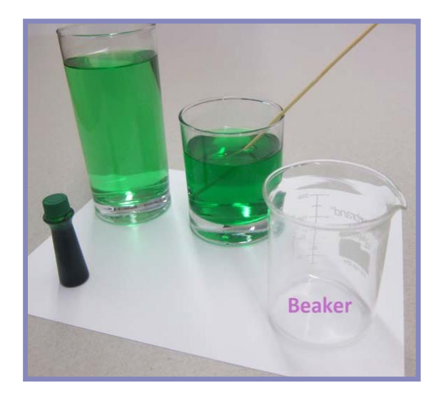
Picture 2. Activity set-up using large and small glass as well as an example of a beaker.

another important susceptibility factor, which is age (child versus adult).